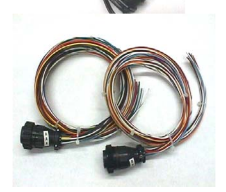
MC81LV connectors A and B are used with the 48" mating cable harnesses for all field wiring.