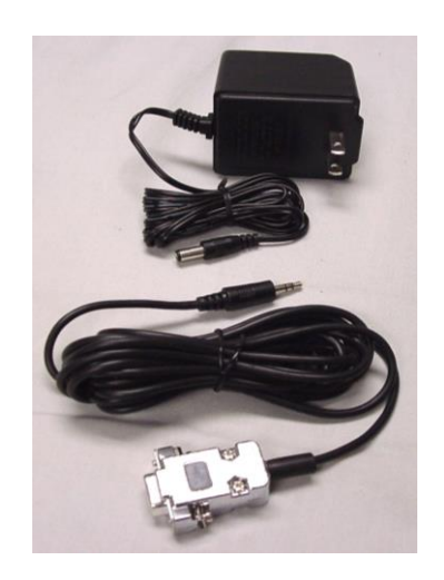
Power Module and RS232 Cable

A power module is provided for powering the CC186U. Plug the power connector from the power module into the <u>12VAC</u> Power jack on the side panel. The other end of the power module can be plugged into a standard 120 VAC power outlet.