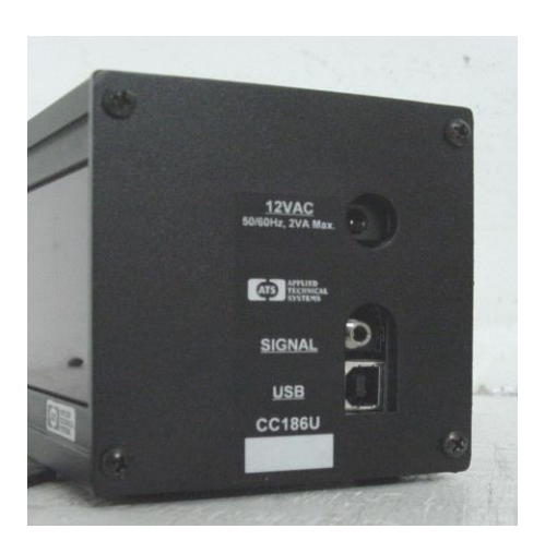
Power and Signal Jacks

BE SURE ALL SYSTEM WIRING IS COMPLETE BEFORE APPLYING POWER TO THE CC186U.