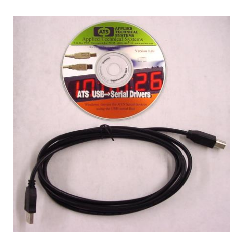
USB Cable and ATS Serial Drivers CD (Available on ats-usa.com)