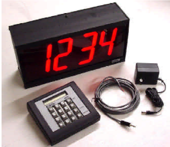
NFSYS1 - Basic NF21 System includes: (1) NF21 Terminal with power modules, 10-foot cable, and (1) CC2002 System Display.