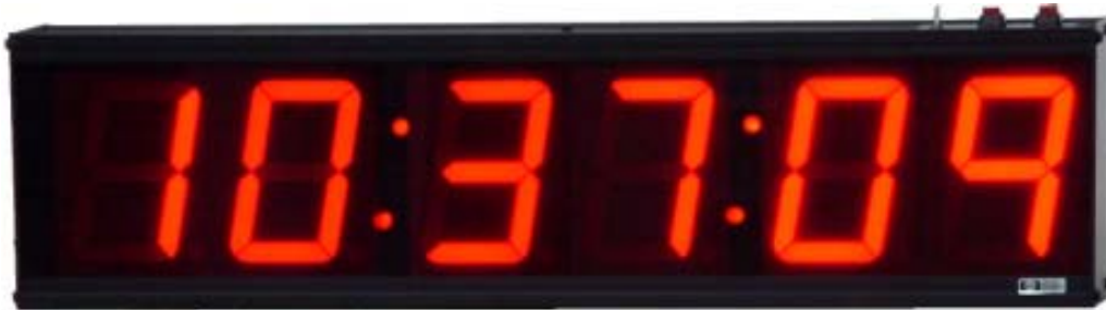
AE46D/CC Super Bright 4-Inch, 6-Digit, Multi-Function Clock/Timer

FOR SCHOOLS, HOSPITALS, FACTORIES, SPORTS FACILITIES, COURTROOMS, THEATERS, BOARDROOMS, CHURCHES, and MUSEUMS.