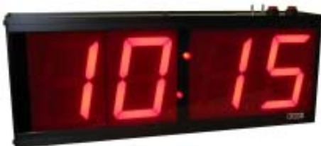
AE44D/CC Super Bright 4-Inch, 4-Digit, Multi-Function Clock/Timer

Low Voltage Power Module Plugs into standard 120 VAC Outlet