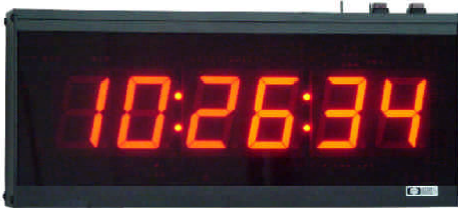
AE26/CC Super Bright 2.3-Inch, 6-Digit, Multi-Function Clock/Timer

FOR SCHOOLS, HOSPITALS, FACTORIES, SPORTS FACILITIES, COURTROOMS, THEATERS, BOARDROOMS, CHURCHES, and MUSEUMS.