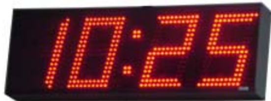
AE84/CC Multi-Function Clock Timer

Eight Inch High Digits SUPER BRIGHT RED Dot LED's 4 and 6 Digit Models Available Visible up to 350 feet