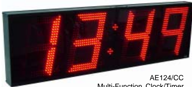
AE124/CC Multi-Function Clock/Timer

Twelve Inch High Digits SUPER BRIGHT RED Dot LED's 4 and 6 Digit Models Available Visible up to 500 feet