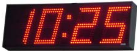
AE84/CC Multi-Function Clock Timer

Eight Inch High Digits SUPER BRIGHT RED Dot LED's 4 and 6 Digit Models Available Visible up to 350 feet